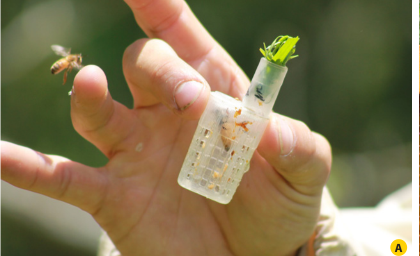
Figure 3. An easy approach to installing a queen is to cage her in a plastic queen cage and cap the cage with grass. Spray the cage with the queen in it with 50% sugar solution in water. Push the queen cage gently into the wax on top of a frame with emerging worker bees and place the frame back into colony next to another frame with emerging workers.

be difficult to acquire a queen due to low supplies or improper season. Inquire with your local bee association to locate available queens. Remove the old queen at least 24 hours before requeening. Introduce the new queen in a queen cage without attendants and place her between the two brood frames toward the top of the frame (fig. 3). To improve acceptance of the queen, spray the queen cage and the bees in the proximity of the queen cage with 50% sugar water solution. Check in 2 or 3 days to see whether the queen has been released or perhaps not accepted by the workers. If a queen cannot be located and the colony is not overly defensive, the queenless colony can be combined with a colony that has a queen. To combine colonies, place a single perforated sheet of paper (e.g., newspaper) between the two colony boxes (fig. 4) to provide a barrier so the workers do not attack each other and allow them to slowly get accustomed to the smell of the new colony as they chew through the paper to remove it. If an excessively defensive colony cannot be requeened, move it out of an inhabited area or abate (destroy) it.