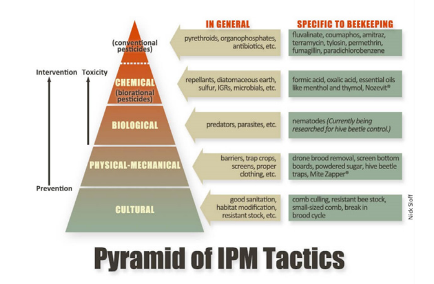
Figure 5. The pyramid of IPM tactics, showcasing various management techniques for maladies affecting honey bee colonies. The arrows indicate increasing toxicity of management strategies used, from the bottom of the pyramid (prevention) to the top of the pyramid (intervention). Please note that while biological control via microorganisms (e.g., fungi, bacteria) is often considered less harmful than the use of chemical control, it could have negative effects on nontarget organisms.

For example, to minimize the impact of varroa mites, you can requeen a colony with hygienic bee stock (e.g., varroa-sensitive hygiene, Minnesota hygienic, etc.) and preform drone comb removal in the spring while monitoring varroa mite levels with established techniques (see the eExtension website, http://articles.extension. org/pages/33632/methods-for-varroa-sampling#.U_362sVdU7k); monthly monitoring is recommended during the active bee season). Managing varroa mites should also help minimize the impact of viral infection since many viruses can be transmitted by Varroa . No commercially available treatment for viral infection currently exists, although a product has been formulated but it was not widely used in the commercial market.