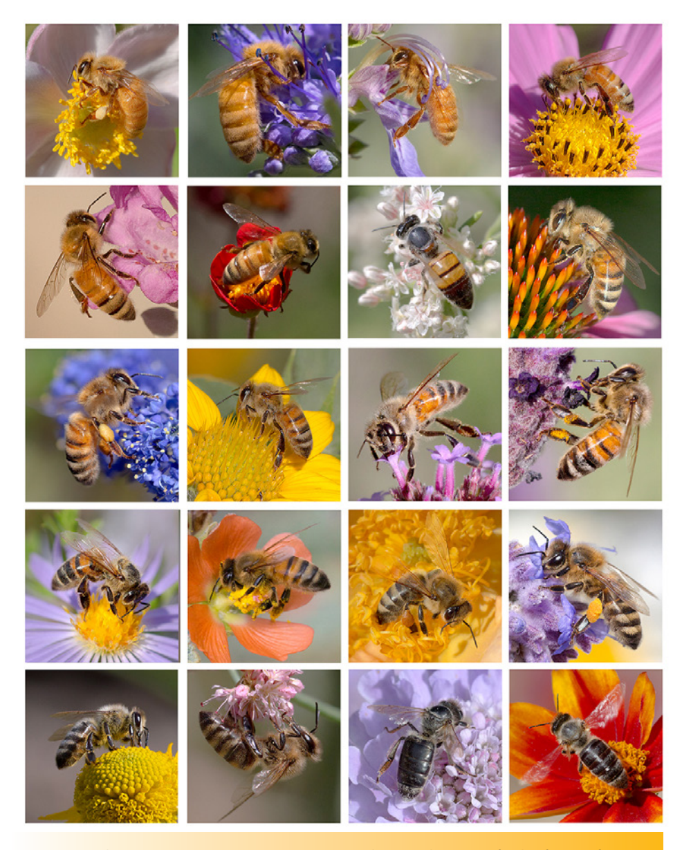
Figure 1. The "Do You See a Honey Bee?" poster shows a diversity of color forms of Apis mellifera.