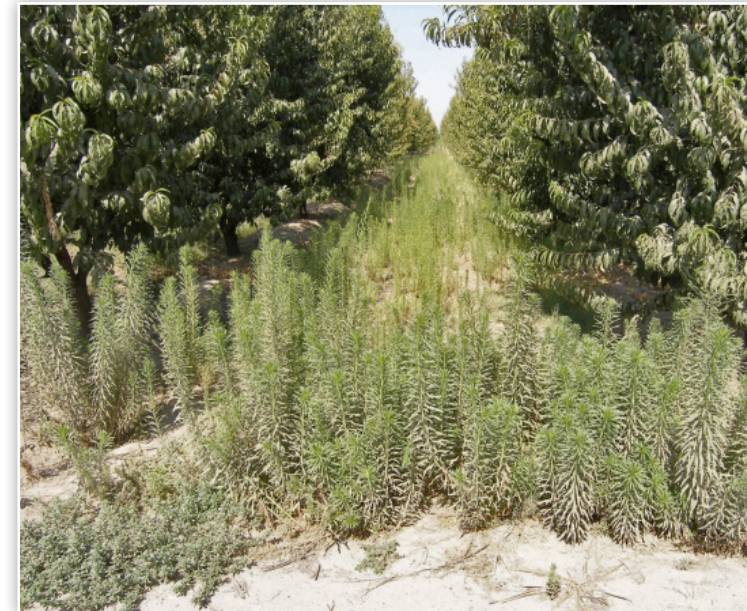
Figure 1. Stone fruit orchard in Fresno County, California, dominated by glyphosate-resistant horseweed. Reliance on one method of weed control imposes selection pressure on tolerant species or resistant biotypes.

Weedy plants can be tolerant of herbicides due to a variety of temporal, spatial, or physiological mechanisms. For instance, a weed may avoid control efforts if it emerges after a burndown herbicide is applied or completes its lifecycle before a postemergence herbicide is applied. Similarly, large-seeded or perennial weeds can emerge from deeper in the soil and may avoid germinating in soil treated with a preemergence