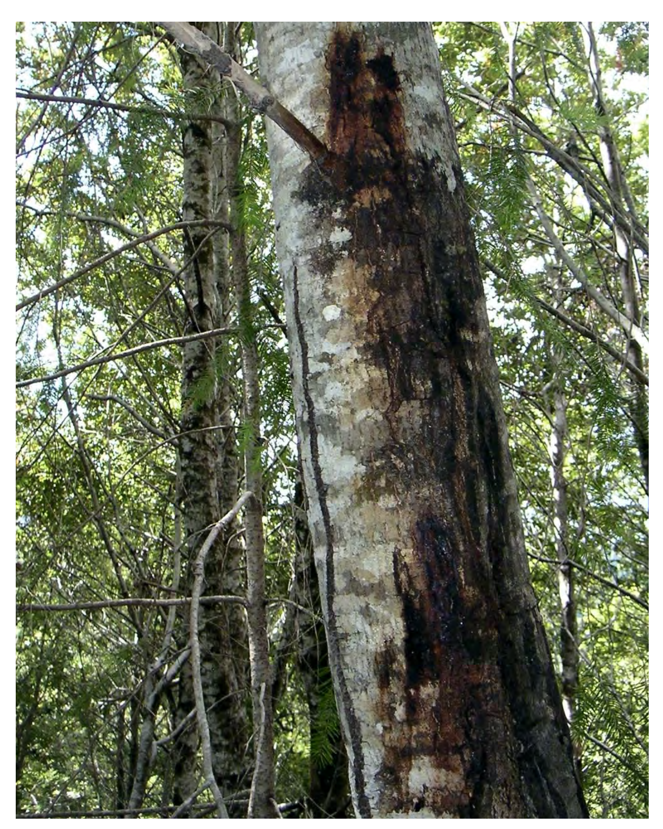
Figure 3. Bleeding cankers on a small tanoak stem.