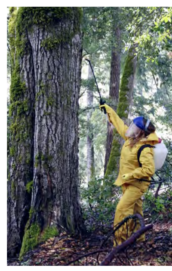
Figure 4. Topical application of Agri-Fos systemic fungicide to a tanoak stem.

Nonetheless, while individual true oaks may remain healthy in a grove even after multiple waves of infections, a single wave of infection can affect a large number, or even all, of the tanoaks growing on the same site. This is because P. ramorum sporulates well from tanoak but not from true oaks; thus, it can spread from tanoak to tanoak but not from true oak to true oak. For this reason, phosphonate treatments are recommended for individual true oaks that have few to no symptoms, even within infested groves, while tanoak treatments are recommended only if the entire stand or grove is healthy and infection is at least over 100 yards away.