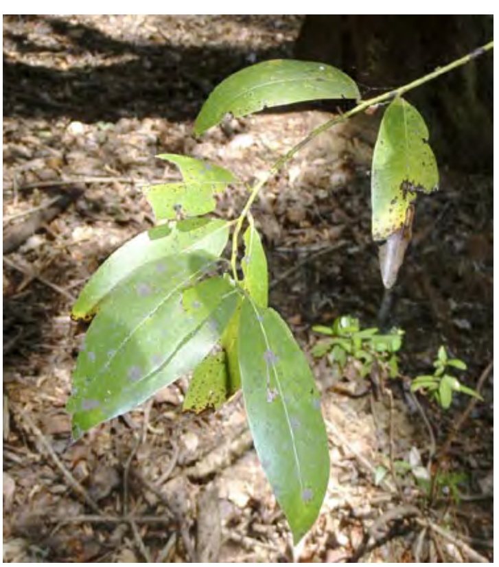
Figure 1. Common symptoms of Phytophthora ramorum infection on leaves of California bay laurel.

within 1 to 3 miles of your property. Many