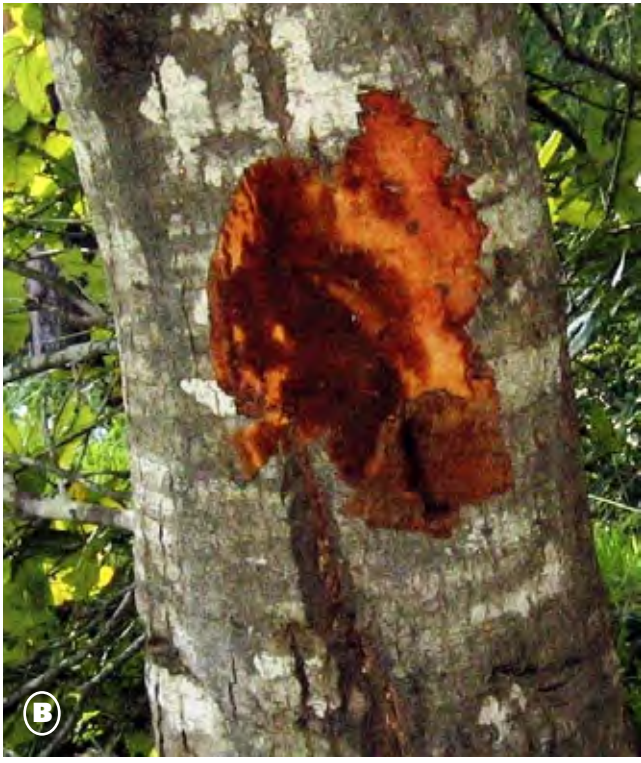
Figure 2. Small canker on tanoak (A, small dark areas on upper middle portion of stem) and after bark removal (B). Canker images are for illustration purposes only. Bark removal to this extent is not recommended; the wound created could serve as an entry point for pathogens.