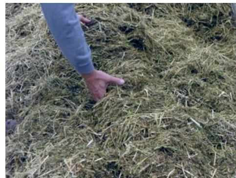
Figure 3. Cutter-baled rice straw mixes evenly into a dairy heifer total mixed ration (TMR).

Rice straw has great potential for use in rations for dairy replacement heifers. Rice straw can supply them with a lower-cost forage that stimulates rumen development and provides bulk that limits total feed intake. The potential of this market can be determined on the basis of the number of heifers raised in dry lots and their daily consumption potential. In 2008, for example, there were approximately one million dairy replacement heifers in California and about 85 percent of them were fed a TMR in dry lots. Rice straw feeding demonstrations conducted by UC Cooperative Extension showed that rice straw baled with a cutter baler with less than 12 percent moisture