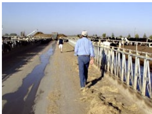
Figure 2. Heifers have refused this flail-chopped rice straw from the total mixed ration (TMR) fed 24 hours earlier.

Rice straw has great potential for use in rations for dairy replacement heifers. Rice straw can supply them with a lower-cost forage that stimulates rumen development and provides bulk that limits total feed intake. The potential of this market can be determined on the basis of the number of heifers raised in dry lots and their daily consumption potential. In 2008, for example, there were approximately one million dairy replacement heifers in California and about 85 percent of them were fed a TMR in dry lots. Rice straw feeding demonstrations conducted by UC Cooperative Extension showed that rice straw baled with a cutter baler with less than 12 percent moisture