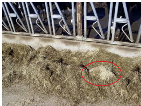
Figure 1. Flail-chopped rice straw does not mix evenly with other total mixed ration (TMR) components (note the clumping in the circled area).