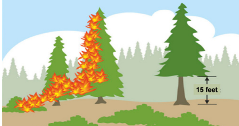
Figure 1. Eliminate ladder fuels to minimize the movement of ground fire into the crown of a tree.

Fire climbs neighboring trees like a ladder. To reduce the chance of fire climbing a tree, remove lower tree limbs 6 to 15 feet from the ground (or the lower third of branches on smaller trees).