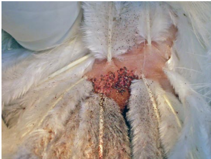
Figure 4. Northern fowl mites feeding on poultry.

A chicken mite can complete its life cycle in as few as 7 days. Adult females lay small groups of eggs in the environment surrounding their avian host. Eggs hatch in approximately 2 days, and the hatched larvae molt in 1 to 2 days without feeding. At all other life stages, this mite feeds on blood. Adult chicken mites can survive up to 34 weeks of starvation, so they are able to survive long periods where nests or poultry houses are unoccupied. This makes treatment of the entire poultry facility imperative if you want to control this pest.