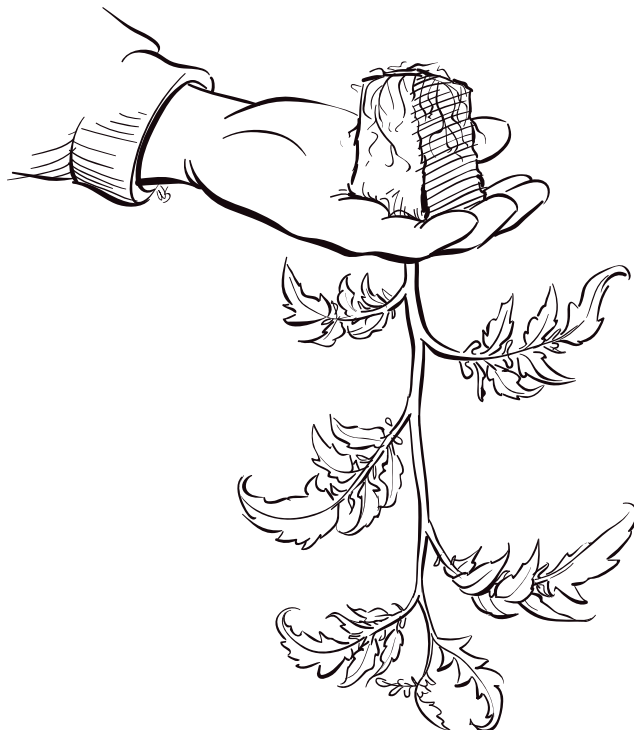
Figure 2. Avoid handling the stems or root ball of tomato transplants. Illustration by Will Suckow.

During planting, avoid damaging the roots. If the seeds were planted in biodegradable containers such as peat or paper pots, do not remove the containers, but break them up slightly so the roots can easily grow out into the surrounding soil. Be sure to bury peat or paper pots completely to avoid “wicking” of water away from the root zone. If plastic or other nonbiodegradable containers were used, ease the plants out of the pots before transplanting and gently loosen the roots somewhat. Avoid bruising the main stems of transplants—try to handle them by the leaves or root ball (fig. 2). Press soil firmly around each transplant so that a slight depression is formed for holding water, then water in thoroughly to settle the soil and eliminate any air pockets around the roots.