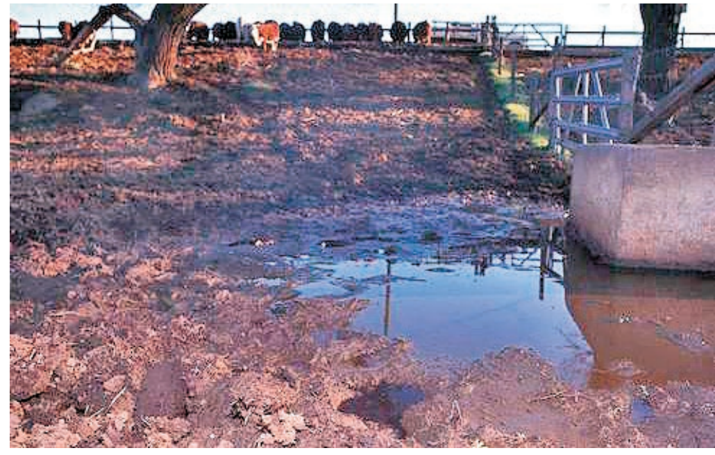
Figure 6. Mosquitoes can breed in poorly drained dairies.

Draining fields at the end of the growing season does not usually generate a mosquito problem because remaining predators tend to concentrate in residual water. Nevertheless, well-graded and even-draining fields, borrow pits, and ditches help reduce mosquito numbers because some areas may lack predators. Rice fields can also produce mosquitoes in the fall if they are reflooded for straw decomposition and to create wildlife habitat. Fields should be reflooded as late as possible because mosquito reproduction decreases in cold weather.