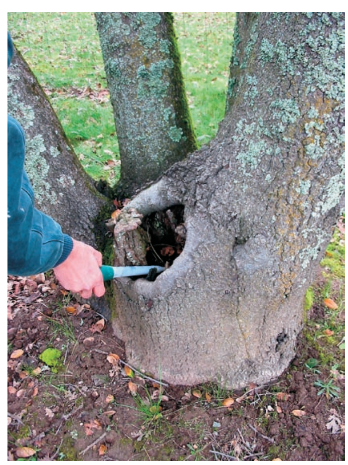
Figure 3. Treeholes like this one may provide habitat for mosquitoes.

Rain water that accumulates in treeholes (fig. 3) can provide an ideal place for the western treehole mosquito to develop its larvae, usually in winter and spring. This mosquito carries dog heartworm, and dogs should be protected against this serious disease. Treeholes can occur in old orchard and landscape trees as well as in wild trees.