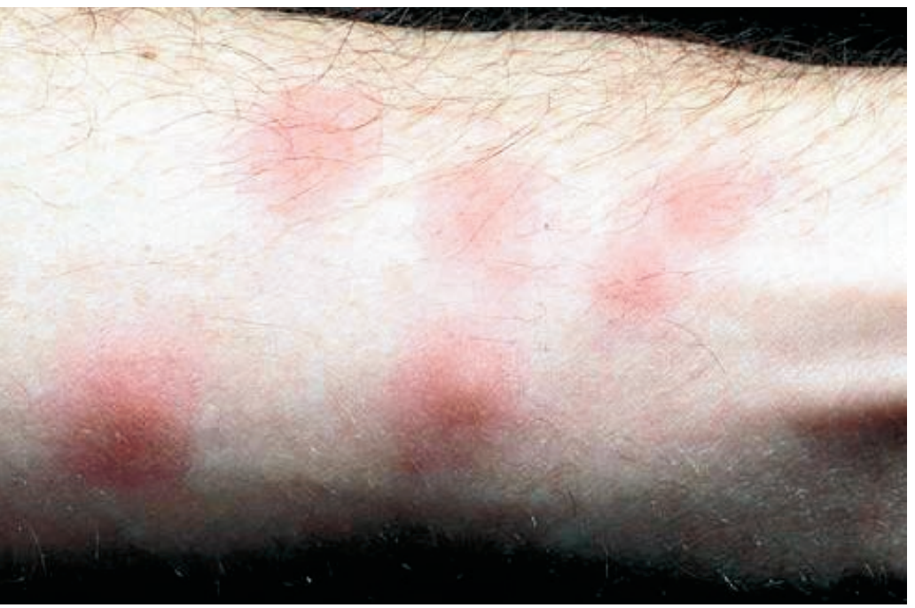
Figure 1. A bumper crop.

Third, mosquito problems can decrease property values and cause labor problems. Areas infested with mosquitoes are less desirable places to live and work. Farmworkers may refuse to work if a serious mosquito problem exists. Homeowners