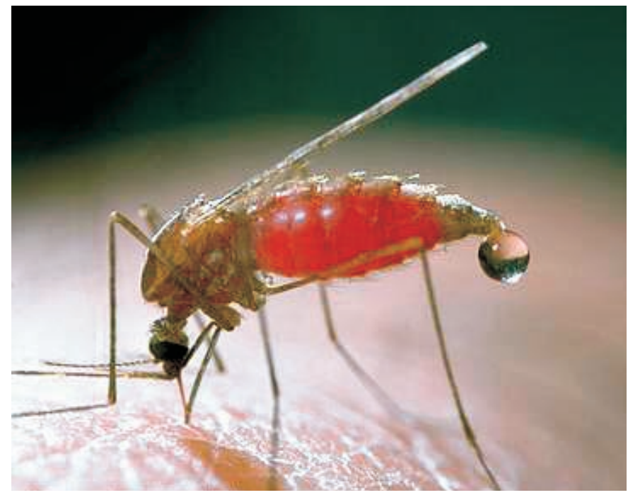
Figure 9. Anopheles freeborni.

but may bite during the day in deep shade. Females obtain blood meals from birds or mammals and can transmit diseases between these groups. They are active in spring through fall. They survive through the winter as adults in barns, culverts, caves, and similar dark, protected places.