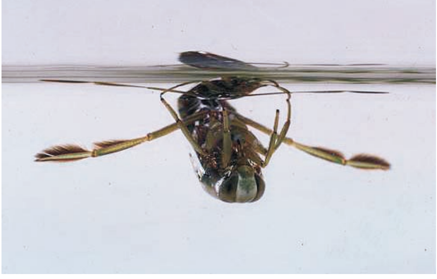
Figure 7. Dragonflies (left) and backswimmers (above) can provide natural mosquito control.