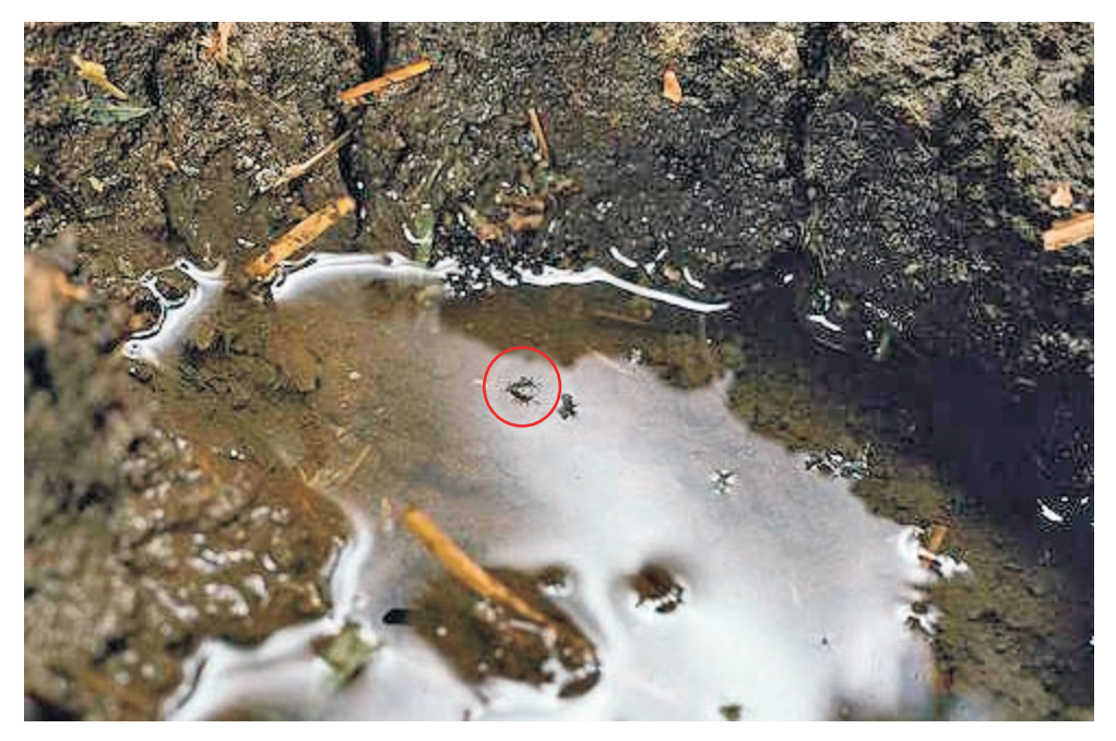
Figure 4. A mosquito (circled) emerges from a water-filled hoofprint caused by putting livestock on a wet pasture.