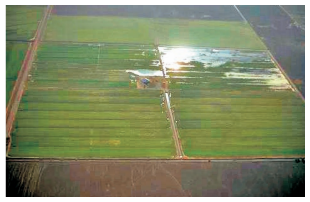
Figure 5. Standing water in irrigated rice presents a great challenge for mosquito control.

Floodwater mosquitoes ( Ochlerotatus melanimon ) can breed in rice fields. These mosquitoes appear within a day or two of flood-up and can occur in very large numbers. Check with