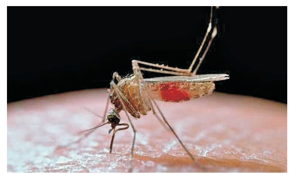
Figure 8. Culex tarsalis.

in your area, it is helpful to make sure that mosquito control and drainage have been considered and that the local MVCD is aware of the project.