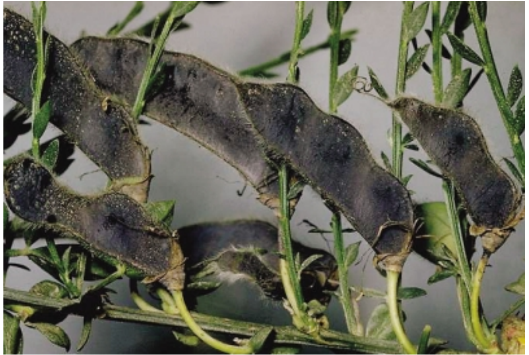
Figure 2. Scotch broom seed pod.