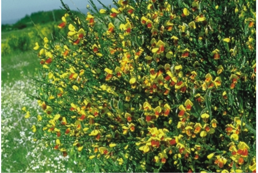
Figure 1. Mature scotch broom.