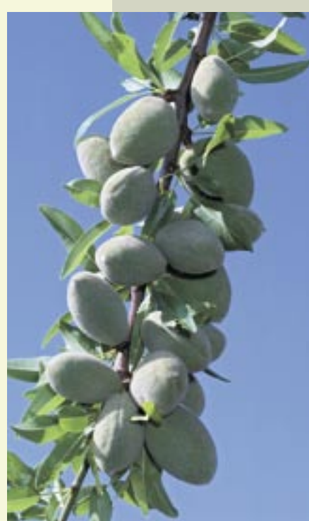
Almond nuts growing