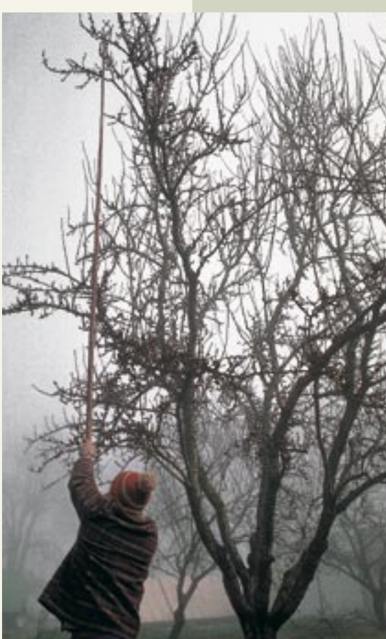
Navel orangeworm mummy nut removal