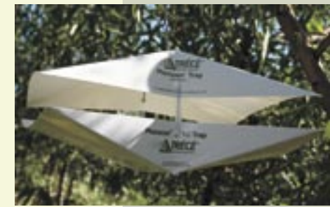
Peach twig borer trap