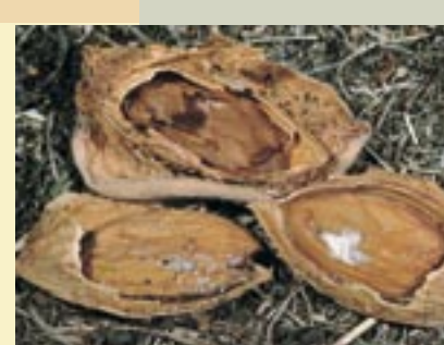
Ant damage to nuts