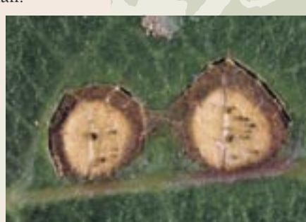
Shothole fungus sporodochia