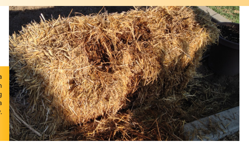
Figure 2. Damage to a straw bale treated with fish emulsion during conditioning by a raccoon.

frequent but small additions until the bales are saturated. At that point the bales are planted and liquid feed continues at every watering; 1.5 teaspoons (7.5 mL) of 24-8-16 in 5 gallons of water (19 L) will approximate his method.