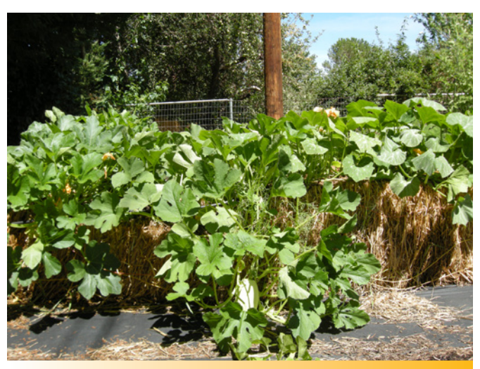
Straw bales in midseason.

Microorganisms will attempt to break down the straw bales as soon as the bales are moistened. During this process nutrients—primarily sources of nitrogen—will be tied up by the microbes as they decompose the straw. As a result, plants growing in root-zone environments high in carbon, such as straw bales, may not have essential nutrients available for growth, even if fertilizer is applied, until the straw has sufficiently decomposed.