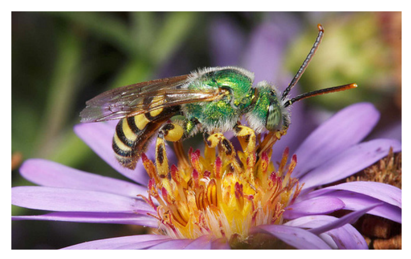
Figure 1. Male of Agapostemon texanus visiting Aster sp.

The relationships that exist between flowering plants and pollinators are not casual, as many plants and pollinators have coevolved over long periods of time to efficiently exchange services. Pollination of flowers by pollinators is the unintended outcome of their activity on the flower. As pollinators visit flowers to sip nectar