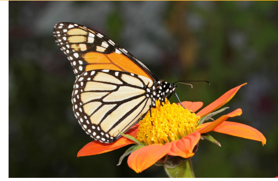
Figure 4. Monarch butterfly ( Danaus plexippus ) visiting a Tithonia rotundifolia flower.