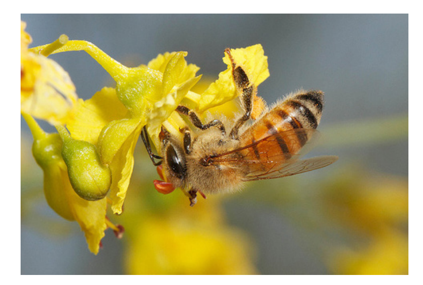
Figure 2. Honey bee (Apis mellifera), visiting Parkinsonia sp.

Bees are the most important biotic agent for the pollination of agricultural crops, horticultural plants, and wildflowers (Frankie and Thorp 2002; NAS 2007). People are often most familiar with the introduced European honey bee ( Apis mellifera ), which was brought to the eastern United States 400 years ago; it arrived in California around 1850. The honey bee is just one species of bee in this incredibly diverse group of pollinators. Approximately 4,000 species of bees exist in the United States, with 1,600 of those residing in California (figs. 1 and 2). About 20,000 species have been recorded worldwide (DiscoverLife.org). Native bee species come in a variety of shapes, colors, sizes, and lifestyles that enable them to pollinate a diversity of plant species (see also Griffin 1997).