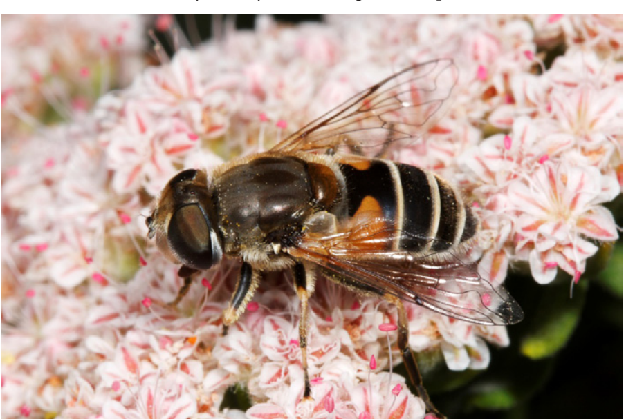
Figure 6. The common hover fly (Eristalis arbustorum) visiting Eriogonum.

pollinators are important inhabitants of gardens because they visit wide varieties of plants, searching mostly for nectar and in some cases pollen (fig. 6).