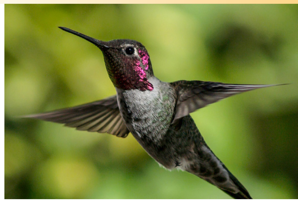
Figure 3. Male Anna hummingbird ( Calypte anna ) hovering and showing its characteristic iridescent rose color on its head and throat.