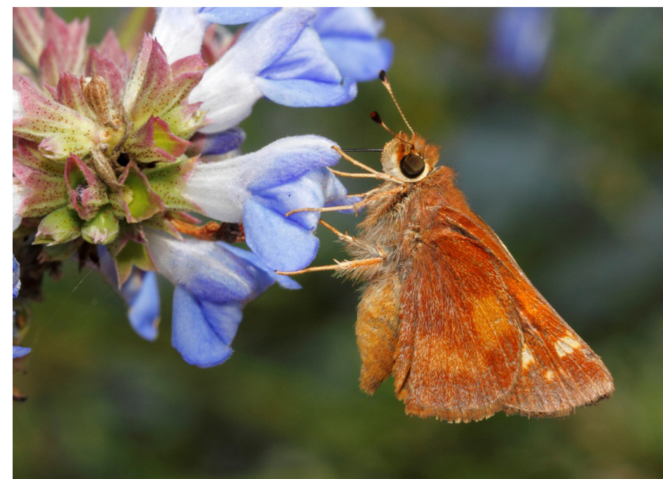
Figure 5. An umber skipper ( Poanes melane ) visiting a Salvia uliginosa flower.

These gorgeous, often colorful, daytime-flying insects have long been purposely lured to flowers by gardeners. Butterfly larvae, or caterpillars, require specific plants to feed on, though the adults can use nectar from many plants. While adult butterflies are not as efficient pollinators as are bees, they do transfer pollen that sticks to their legs as they flit from flower to flower. Their stunning looks have made them attractions at many botanical gardens and zoos, where butterfly houses and gardens stock their favorite flowers for nectar resources (figs. 4 and 5) (Stewart 1997; Xerces and Smithsonian 1998).