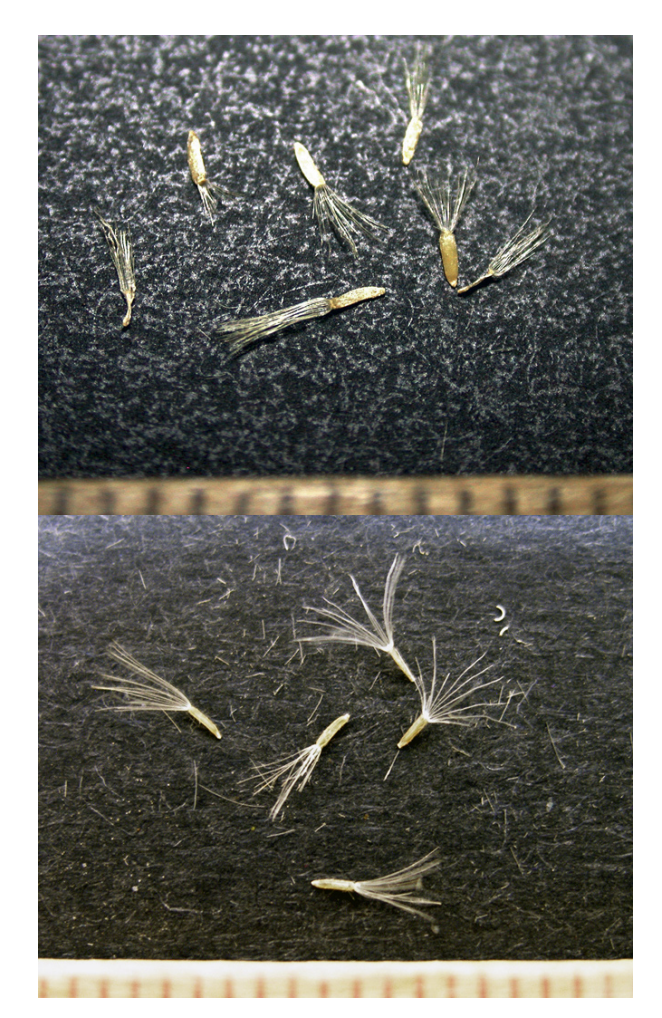
Figure 2. Horseweed (top) and hairy fleabane (bottom) seeds, showing the characteristic pappus that helps in their dissemination.