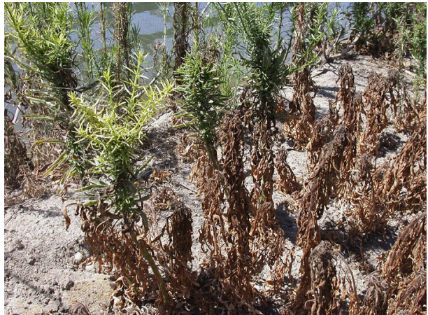
Figure 9. A population of horseweed plants (left) and hairy fleabane (right) showing susceptibility and resistance to glyphosate on a ditch bank. Note the characteristic branching on apex of the surviving horseweed plants on the left.