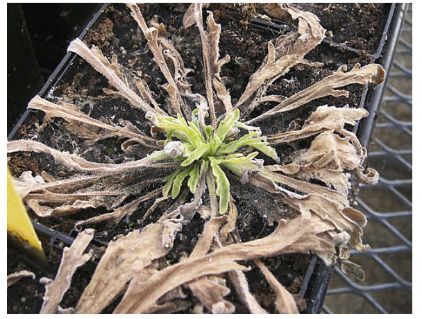
Figure 8. A glyphosate-resistant horseweed (left) and hairy fleabane (right) seedling recovering from herbicide injury.