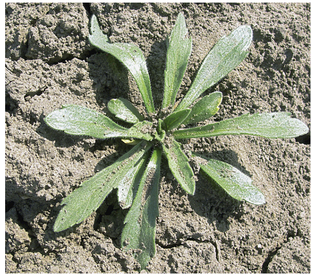
Figure 3. Horseweed seedling (left); hairy fleabane seedling (above).