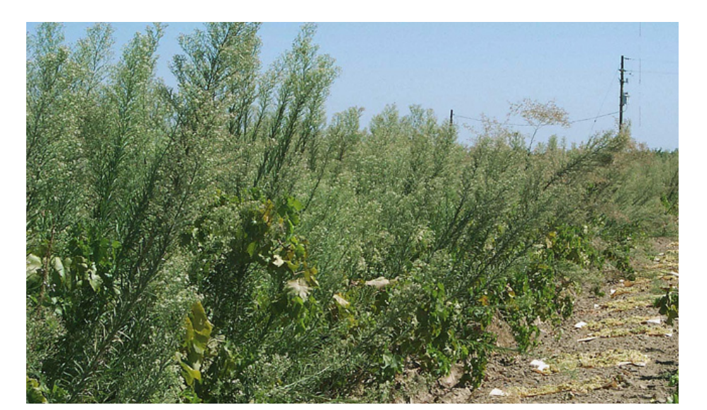
Figure 7. Horseweed plants towering over a grapevine canopy.

Horseweed can be a major problem in vineyards. If not adequately controlled, horseweed will grow through the vine canopy, interfering with harvest and other field operations (fig. 7). Horseweed may be particularly troublesome for raisin growers who use a continuous tray harvest system. In this system, green grapes are harvested