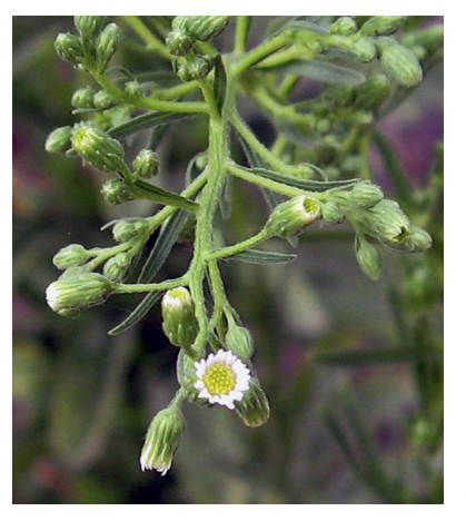
Figure 6A. Horseweed inflorescence (left) and an open flower (top).