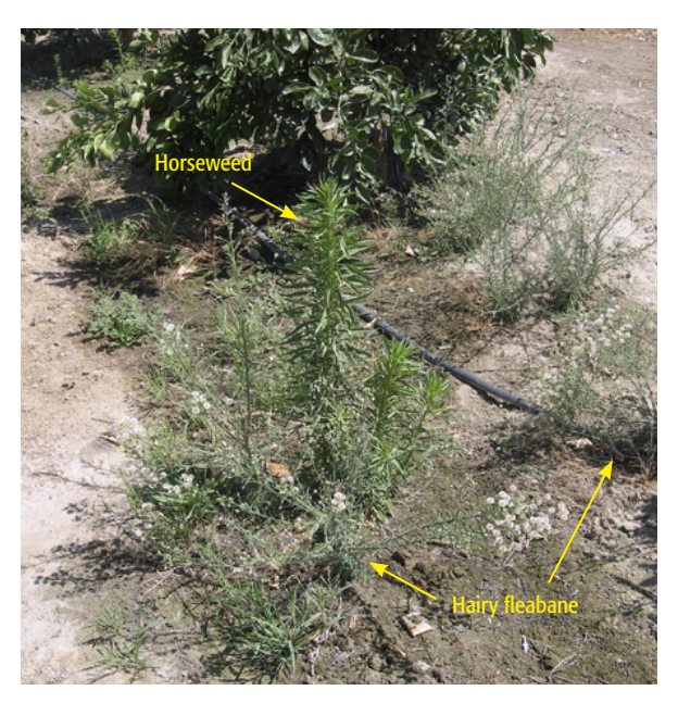
Figure 5. Adult horseweed and hairy fleabane plants in a citrus orchard.