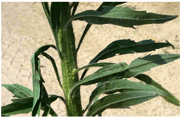
Figure 4. horseweed plant (left) and a hairy fleabane plant (right), showing the arrangement of leaves on the stem.

horseweed, develops multiple lateral branching without a central stem and has leaves that are much narrower with stiff hairs. The distance between the leaves is greater in hairy fleabane than in horseweed (see fig. 4). At maturity, horseweed is usually much taller than hairy fleabane. Horseweed can be 10 feet tall, whereas hairy fleabane is usually 1.5 to 3 feet tall (fig. 5).