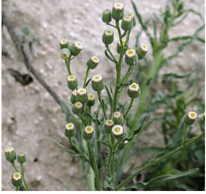
Figure 6B. Inflorescence of hairy fleabane. Photo: A. Shrestha.