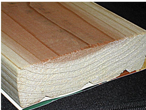
Figure 1. The sapwood of any species is not very durable. Color can often help distinguish the heartwood and sapwood of a species. In this redwood ( Sequoia sempervirens ) board, the reddish wood on top is the heartwood and the white portion is sapwood.

Natural resistance to decay is caused by the extractives (nonstructural organic components found in wood) found in the heartwood. Because the amount and types of the extractives vary from species to species, so does decay resistance. These extractives also give the heartwood its color. Unfortunately, heartwood decay resistance varies within a species, and depends on the original location of the piece of lumber within the tree. This means that with the same exposure to soil or water, two pieces of lumber from the same tree could perform differently. Given our increased use of second-growth timber, many of our naturally decay-resistant species are in fact less resistant to decay than old-growth lumber. (Note, for example, that Table 2 gives old-growth redwood the highest decay-resistance rating, but gives only a moderate rating for second-growth [or young-growth] redwood.)