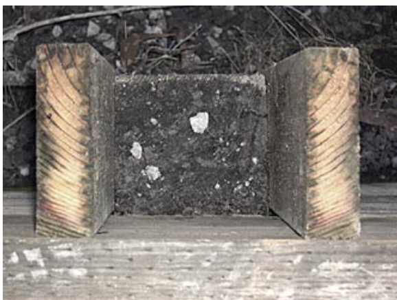
Figure 2. ACQ-treated lumber used in a retaining wall. The end-cut boards reveal a cross-section showing that only the outer shell of the lumber, where discoloration is apparent, contains the preservative chemicals.

The advantage of pressure-treated wood over naturally durable species is its greater potential for uniformity in its useful service life. From a performance perspective, the disadvantage of pressure-treated lumber, particularly species such as Douglas-fir and the Hem-fir species group (hemlock and the true firs) that are commonly used in California and the West, is that the lumber is only treated at and near its outer surface. The lumber’s core usually cannot be treated (Figure 2). If the treated lumber is cut to length or if it is drilled, the user must either apply a field treatment or rely on the wood’s natural