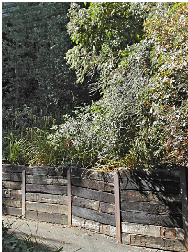
Figure 7. Salvaged creosote-treated railroad ties, now being used in a residential retaining wall.