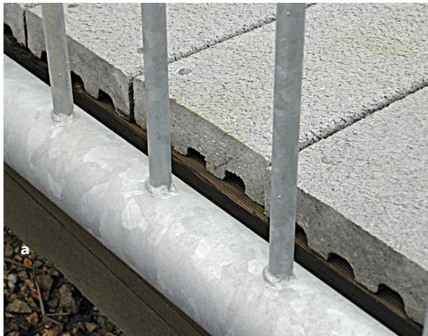
Figure 3. Plastic-lumber composite material is used for deck boards. These boards feature a channeled construction, large grooves on the underside of the boards that reduce each board's weight without reducing its strength.

† CCA-treated lumber is no longer available for residential use; service life information is given here for historical reference.