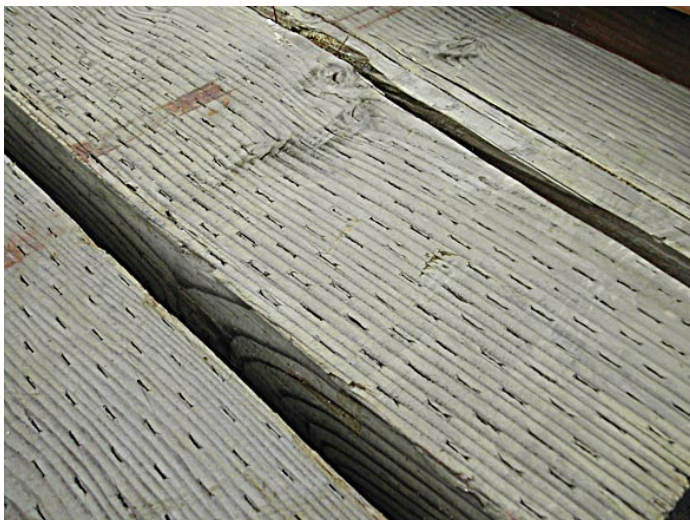
Figure 5. Incised lumber shows visible marks where knives have cut into the lumber surface. Lumber is incised before treatment with preservatives so the chemicals will be able to penetrate deeper into the wood.

A number of fungicides are used commercially in paints and stains to minimize the growth of mold fungi ( mildew ), but only a few are used commonly in over-the-counter preservatives for lumber. The most common are copper naphthenate (typically a green solution) and zinc naphthenate (typically a clear solution). Borate-based preservatives, very effective insecticides and fungicides with low toxicity to humans and animals, are also available. The disadvantage of most borate preservatives is that they are easily leached from wood. In exposures where borate-treated lumber could be repeatedly wetted, this preservative would eventually leach away, leaving the wood unprotected.